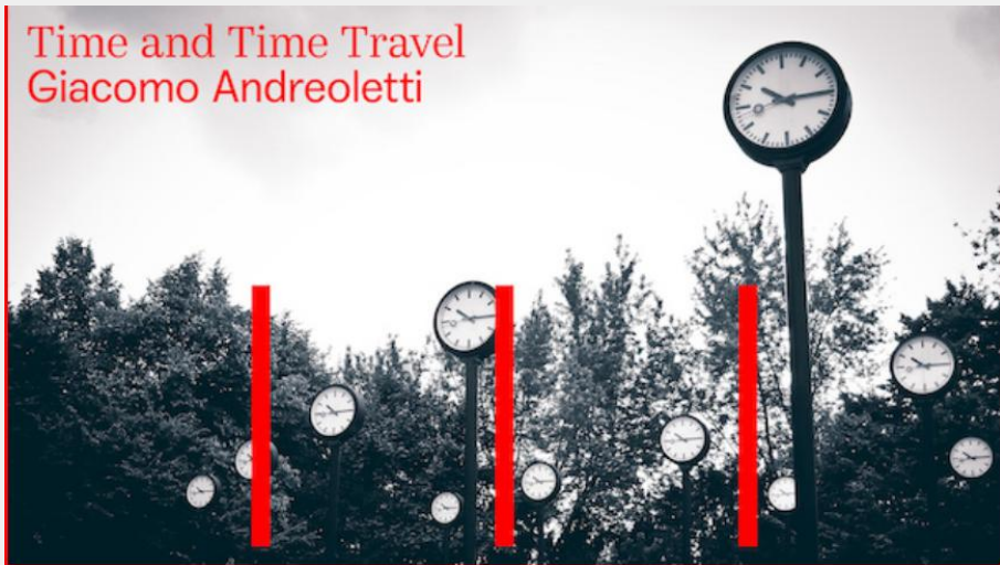
Figure: My open course in Siberia.