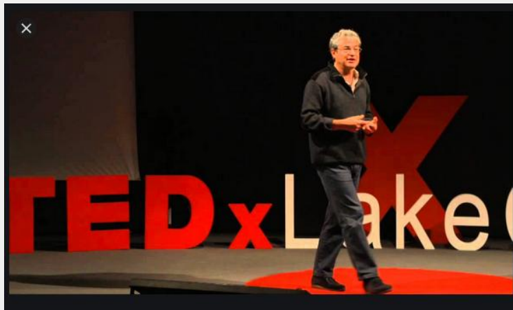
Figure: Carlo Rovelli.